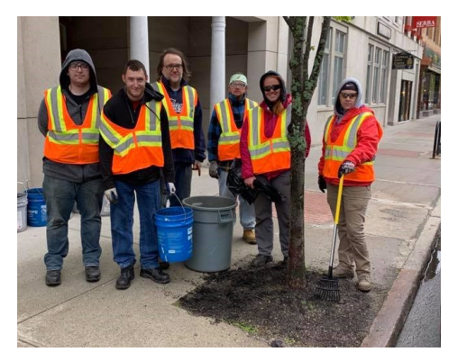
The City of Augusta Crew has been recognized by the city on several occasions for their work in the community. Great job!

We Supported Many Members with Securing Employment this Quarter!