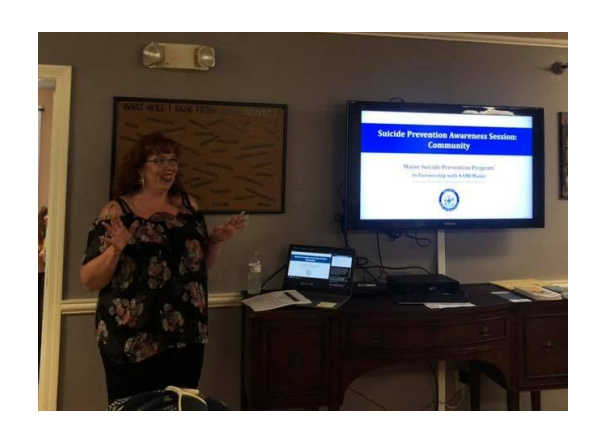
NAMI presented at CC on suicide awareness.