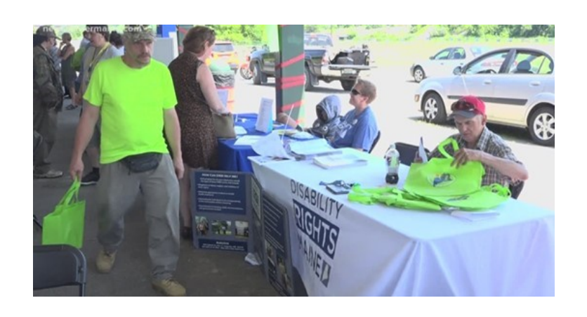
CC represents at Disability Pride Parade.