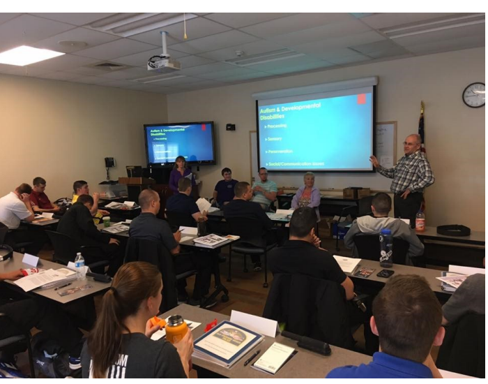
A panel of our clubhouse colleagues presenting to the officers. We love sharing what we do with our community!